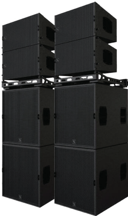
VERTICAL WITH STACKED VD-12L